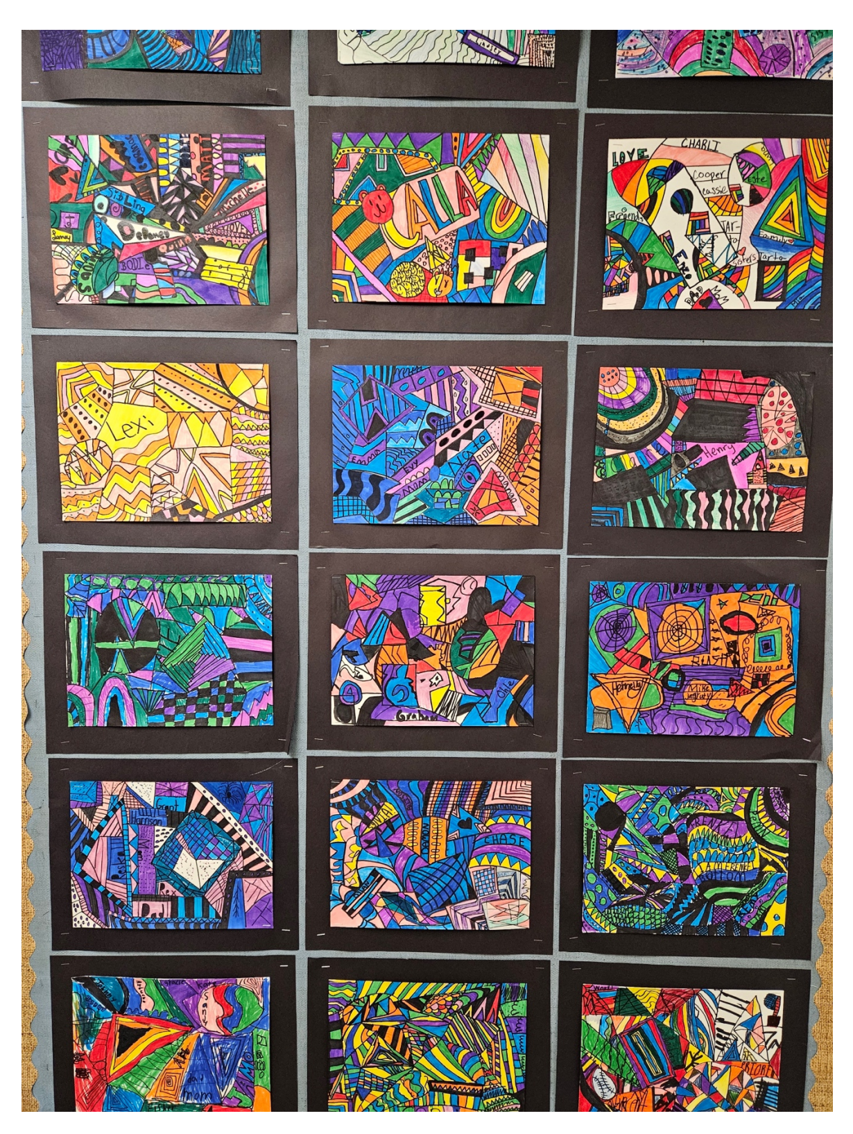
GRADE 4 – DESIGNS BASED ON THE WORK OF JOSEPH AMEDOKPO